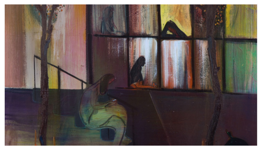
The Future is Elsewhere (If it Breaks Your Heart), detail #7, 2017. Oil on canvas, 60 x 44 inches. Inv. #HH1716